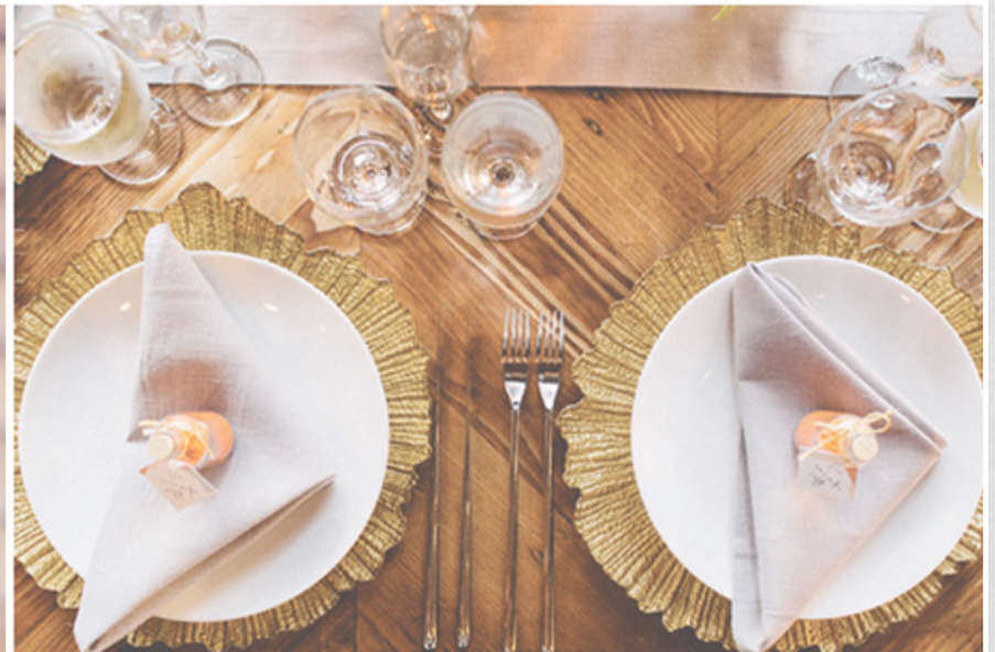
Sweet Little Photographs