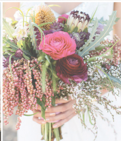
Birds of a Feather