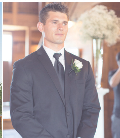
This Love of Yours . . . Photography